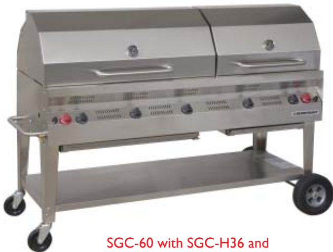
SGC-60 with SGC-H36 and SGC-H24 Smoke Hoods