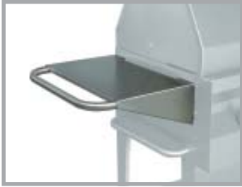
SGR-SS18/SGC-SS21 Stainless Steel Side Shelves

Enhance your grilling experience with the flagro SILVER GIANT™ Accessories Collection