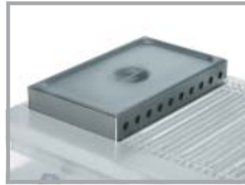
SGC-SPI2 Stainless Steel Steamer Pan