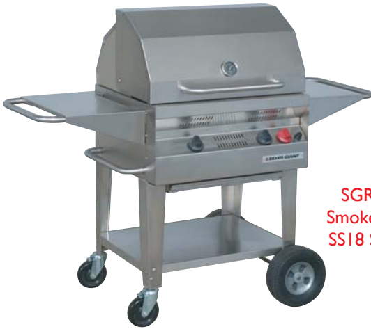
SGR-24 with SGR-H24 Smoke Hood and (2) SGR- SS18 Side Shelves Options