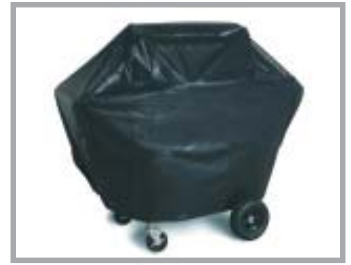
SGR-VC24/SGC-VC36 Heavy Duty Vinyl Cover