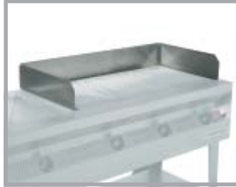
SGC-WS24/36/48 Stainless Steel Windshield