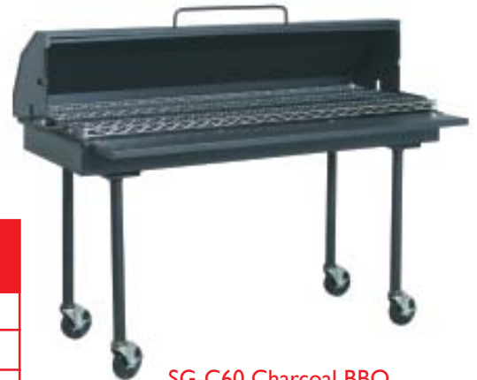
SG-C60 Charcoal BBQ with SG-FSC60 Front Shelf and Smoke Hood SG- HC60 options