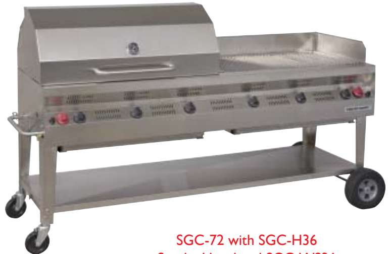
SGC-72 with SGC-H36 Smoke Hood and SGC-W536 Windshield Options