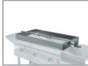
SGC-ROT36 Stainless Steel Rotisserie Kit