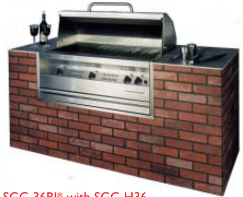
SGC-36BI* with SGC-H36 Smoke Hood option and *optional custom surround