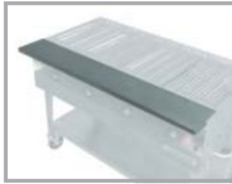
SGC-FR36/48/60/72 Stainless Steel Front Shelf