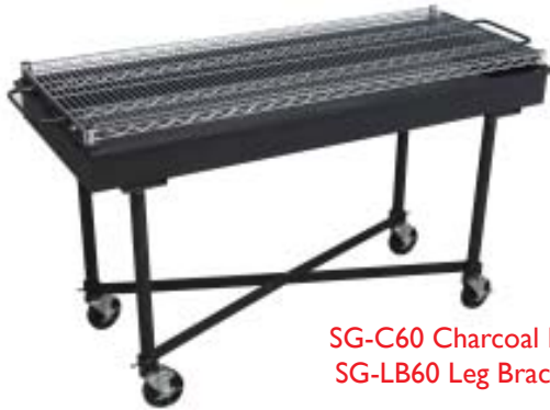
SG-C60 Charcoal BBQ with SG-LB60 Leg Brace Option