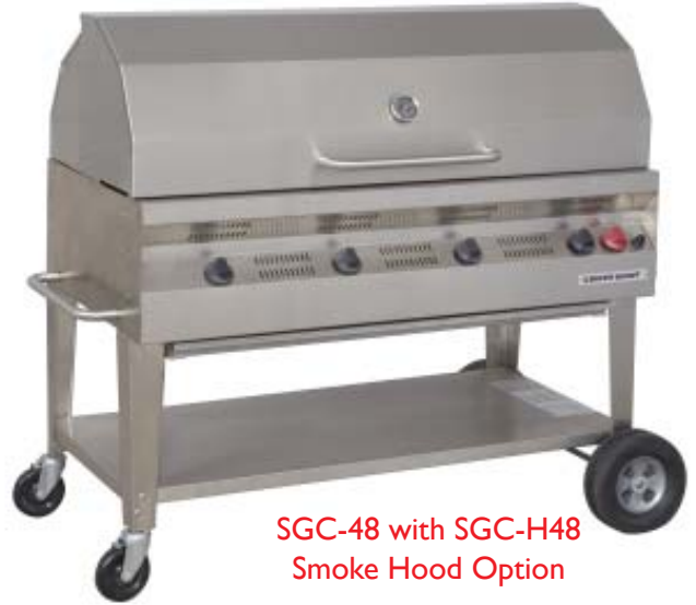
SGC-48 with SGC-H48 Smoke Hood Option