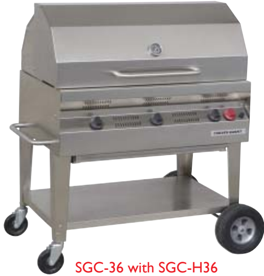
SGC-36 with SGC-H36 Smoke Hood Option