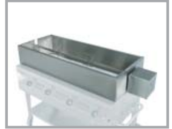
SGC-ROT48 Stainless Steel Rotisserie Kit