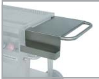
SGC-ST21 Stainless Steel Side Shelf with Sauce Tray